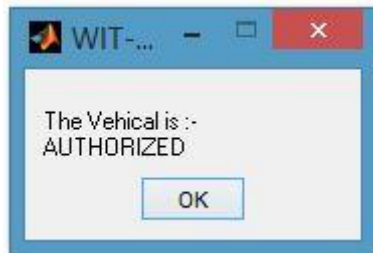
Fig. 8 Dialogue box for authorized vehicle number plate

The proposed algorithm also check whether the license plate is authorized or unauthorized. The extracted license plate compares the extracted number with the database. If the number matches with the database, it will assign as Authorized License Plate. If the number does not matched with the database, then it will display as Unauthorized License Plate. (Figure. 8.)