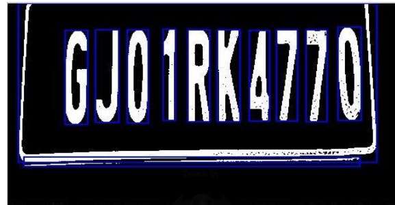
Fig. 4 Segmented license number plate

The main aim of segmentation is to extract the required information from the image. From the extracted license plate, we need to segment each and every character as well as numbers. So by using Connected Component Analysis we segment every character as shown if figure. 4.