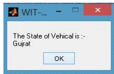
Fig. 6 Dialogue box for State

The extracted number belongs to which State is displayed.(Figure. 6.)