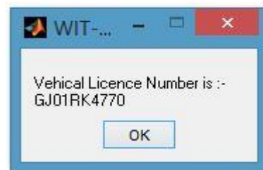
Fig. 5 Dialogue box of license number

The extracted Vehicle License Number is displayed as shown is dialogue box. (Figure. 5.)