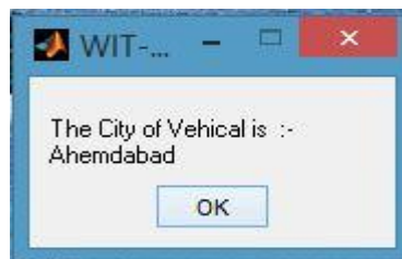
Fig. 7 Dialogue box for city

The proposed algorithm also identifies the number belongs to which city. (Figure. 7.)