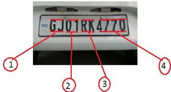
Fig. 9. Sample of Indian vehicle number plate

4- Indicates the actual unique registration number of each vehicle